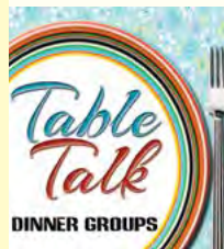
Table Talk Dinner Groups