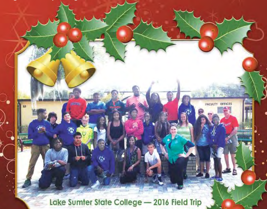
Lake Sumter State College — 2016 Field Trip

Our dream is that as our Mentees graduate, each will be awarded a scholarship of $1,000 to be paid towards their continued education and training. Your generosity will help seed these scholarships, so when our first class graduates in 2019, we have the funds to support their scholarships. Please use the envelopes labeled "Christmas Offering" for this special gift.